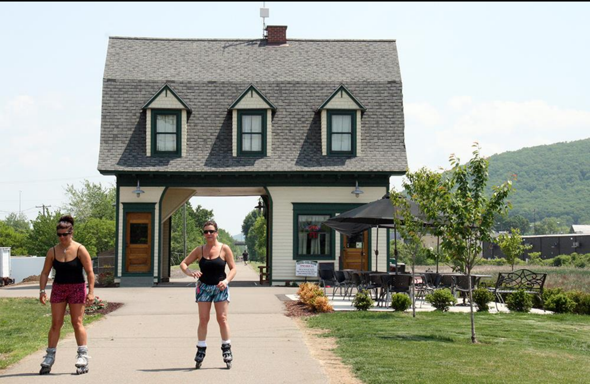
Rounds Coal Company Building, TODAY