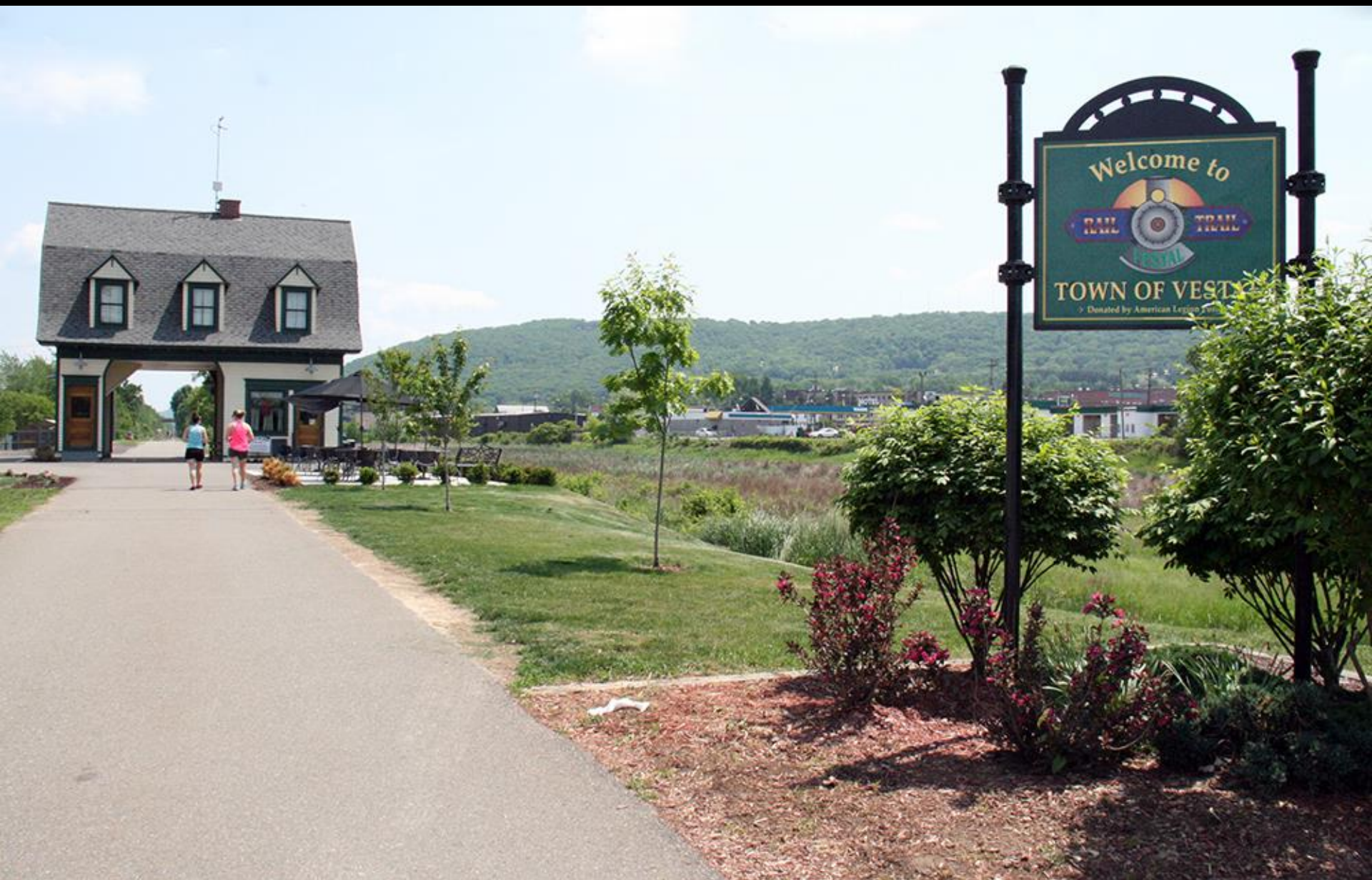
Rounds Coal Company Building, TODAY