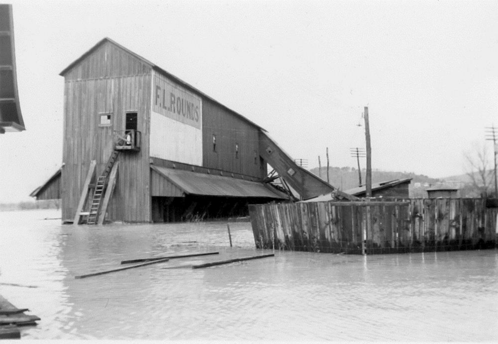
Coal Tippie, flooded