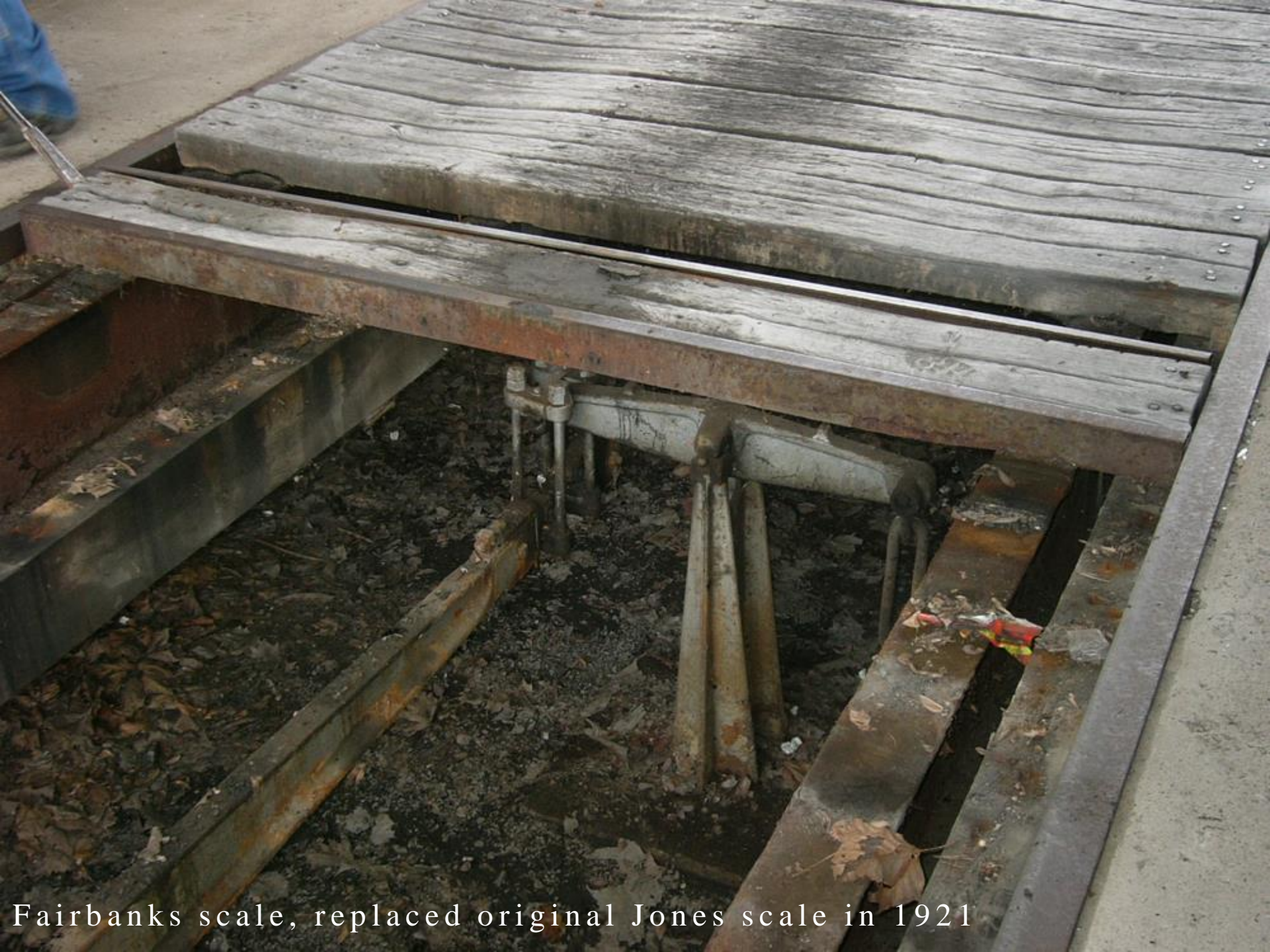
Fairbanks scale, replaced original Jones scale in 1921