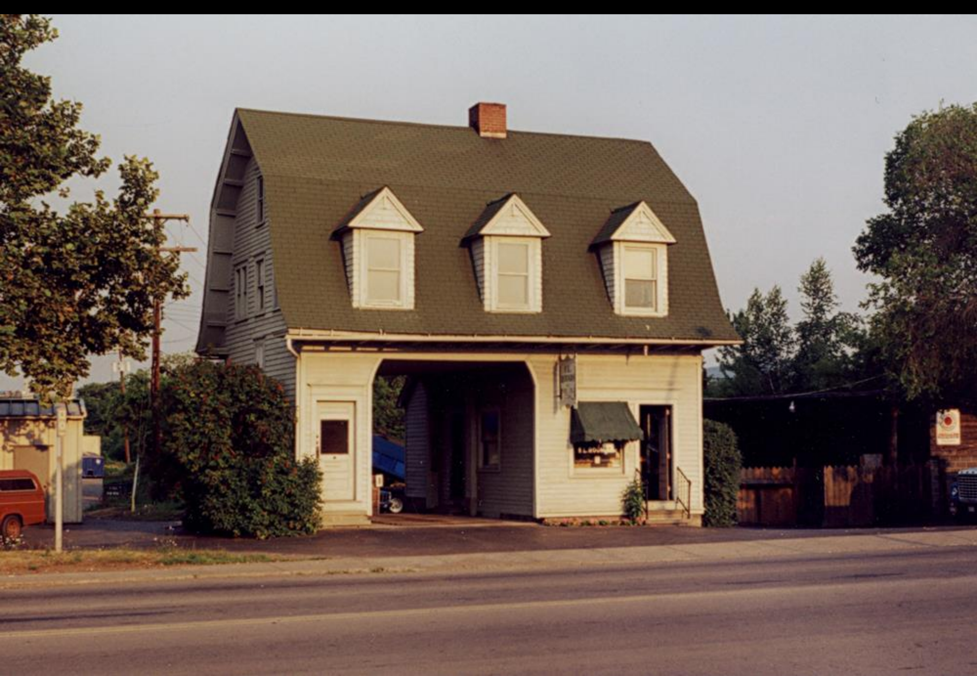
Rounds Coal Company Building, ca. 1950